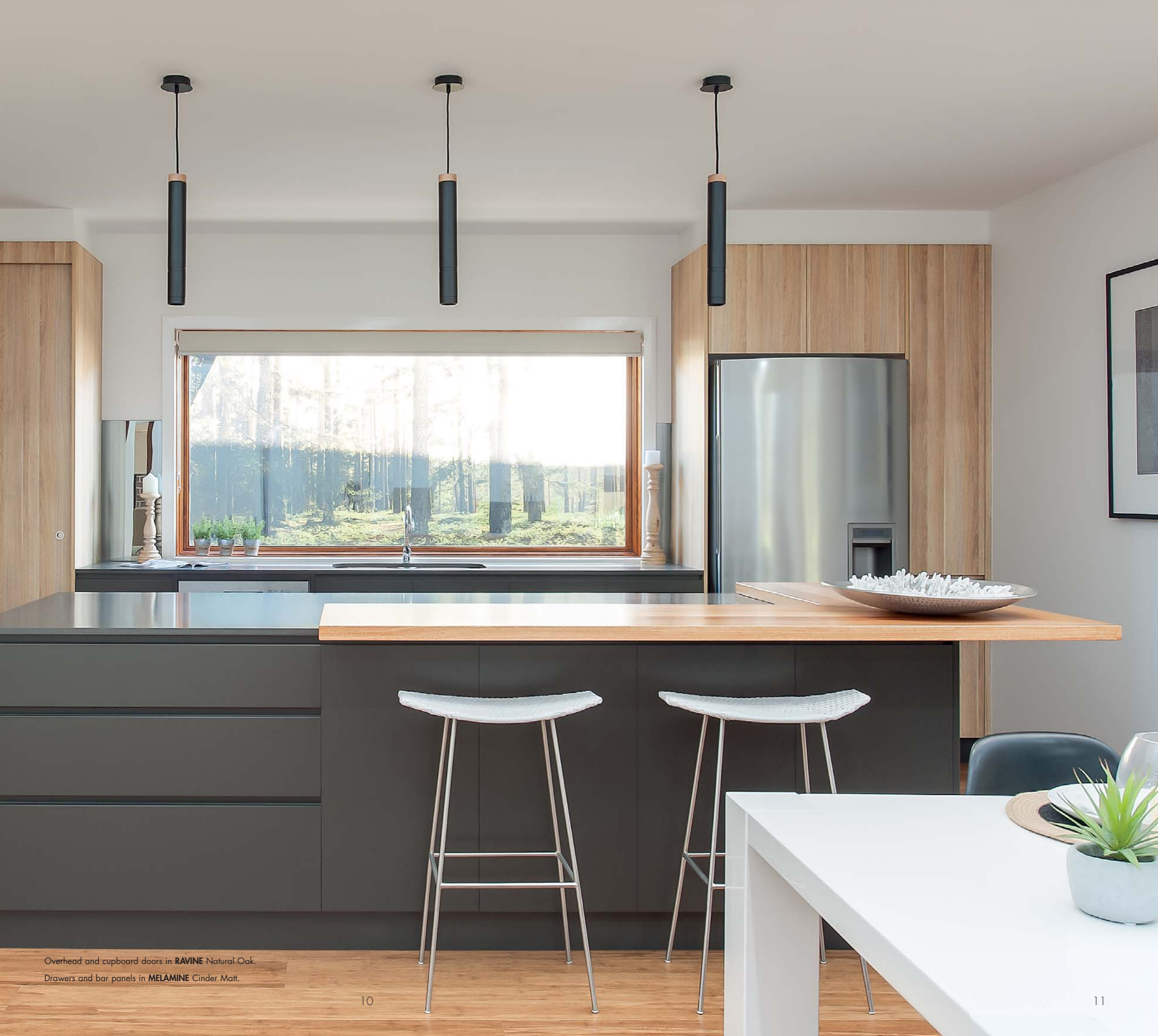
Overhead and cupboard doors in RAVINE Natural Oak. Drawers and bar panels in MELAMINE Cinder Matt.