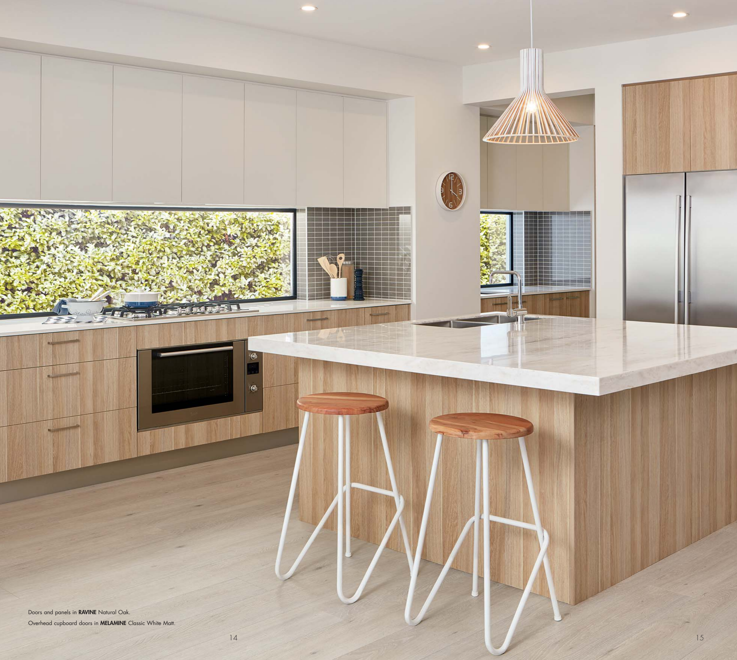
Doors and panels in RAVINE Natural Oak. Overhead cupboard doors in MELAMINE Classic White Matt.