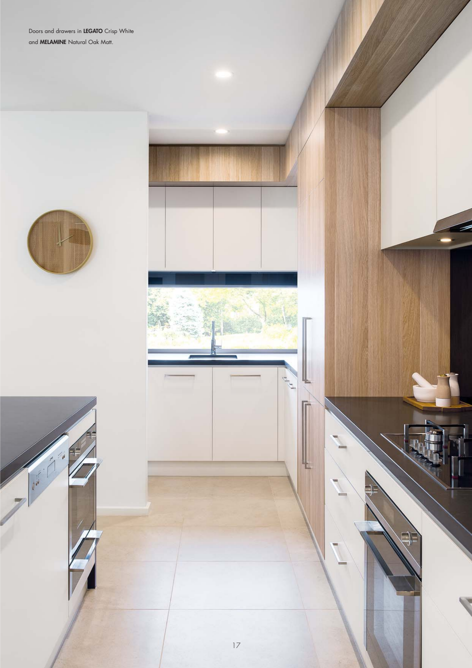
Doors and drawers in LEGATO Crisp White and MELAMINE Natural Oak Matt.