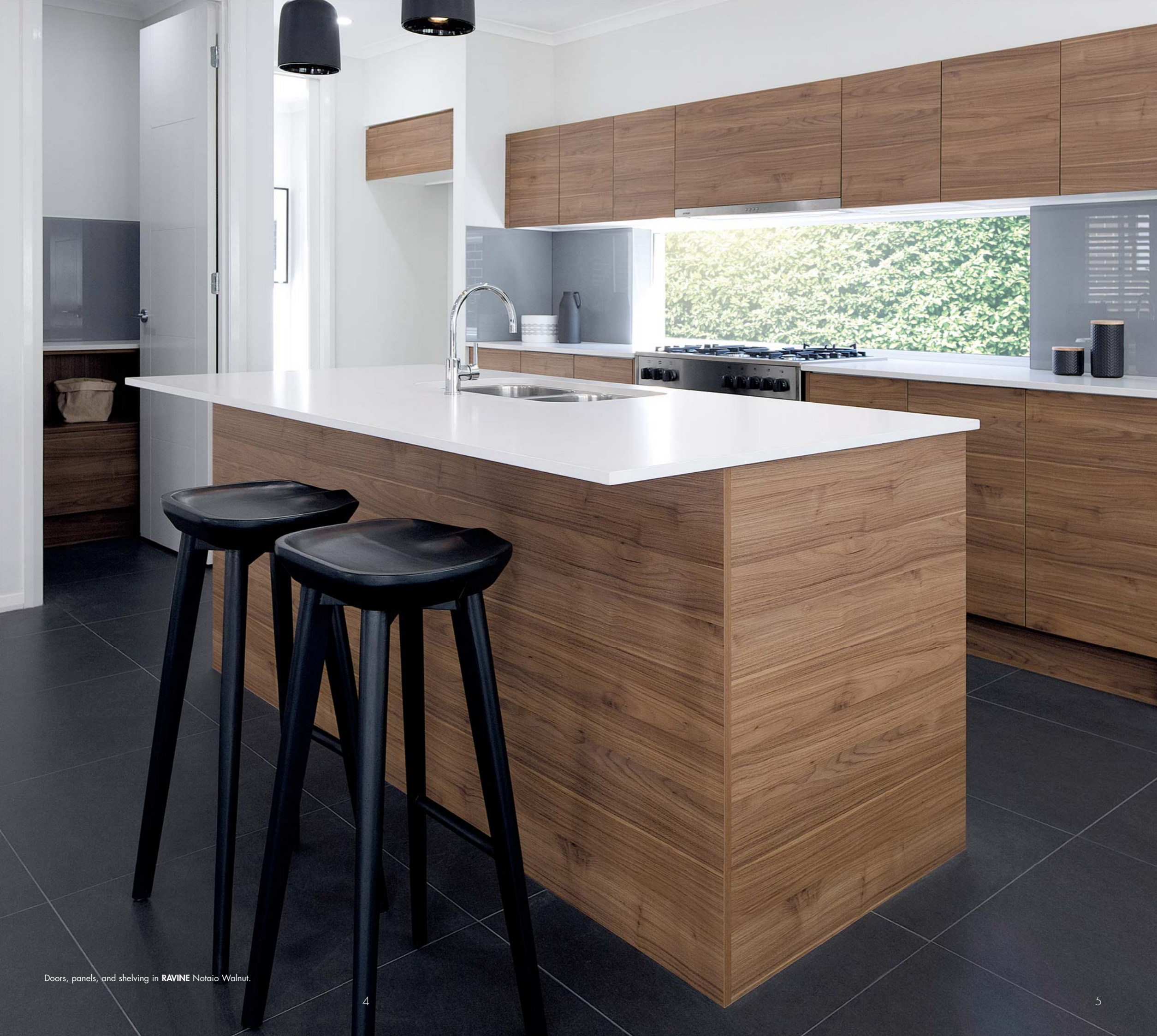
Doors, panels, and shelving in RAVINE Notaio Walnut.